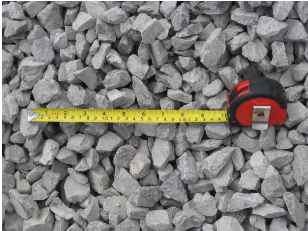
Dolostone Rail Ballast